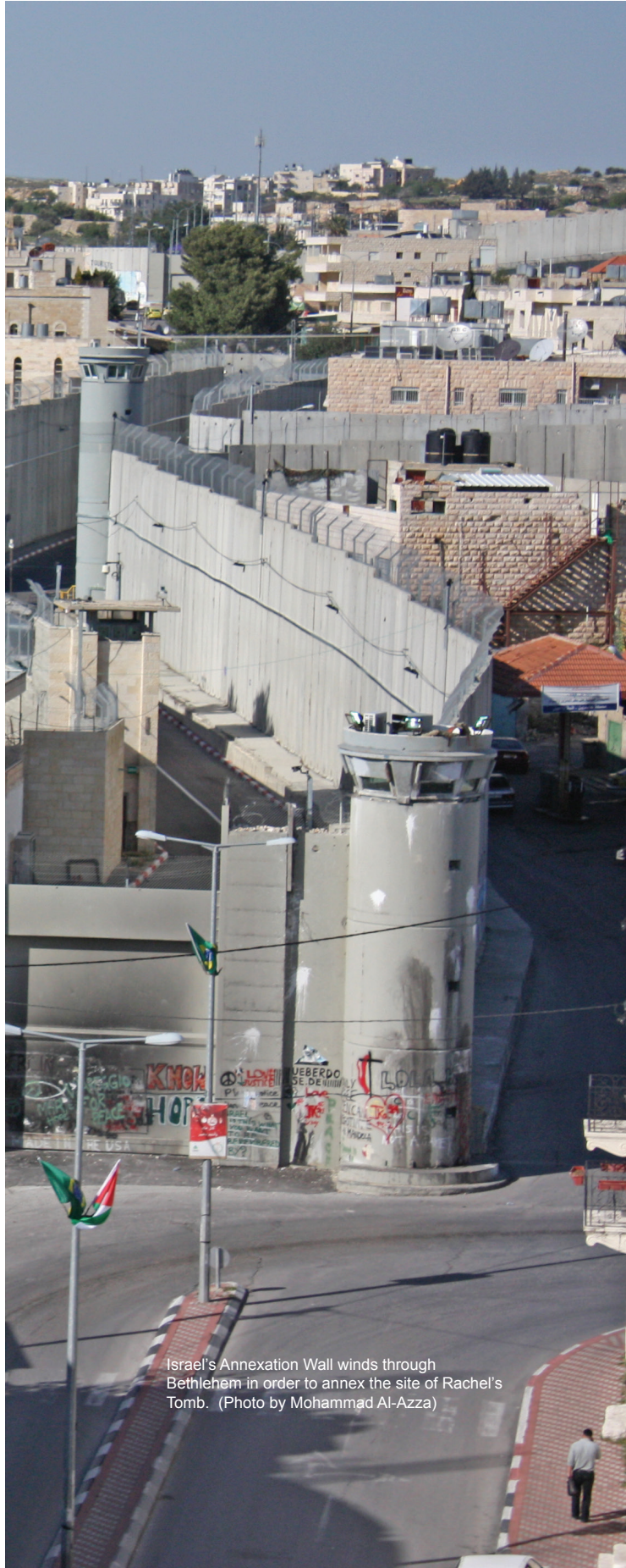
Israel's Annexation Wall winds through Bethlehem in order to annex the site of Rachel's Tomb.