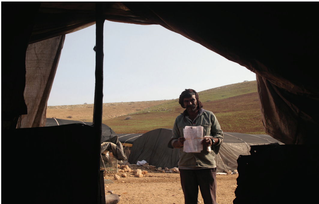
A Palestinian man in the Jordan Valley holding an eviction order issued by Israeli authorities. 2013

As one explores these policies, it will become clear how they infringe upon the Palestinian right to self-determination and the right of return, which is an essential component for the full exercise of the right to self-determination. One will see how the impact of these policies—and the increasing and intensified attacks and incitements by Israeli colonizers—prevent any viable possibility of the existence of a thriving Palestinian community, let alone a Palestinian Christian community.