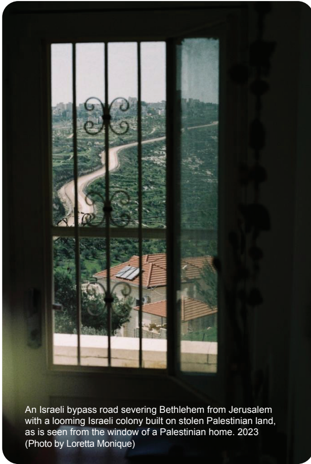
An Israeli bypass road severing Bethlehem from Jerusalem with a looming Israeli colony built on stolen Palestinian land, as is seen from the window of a Palestinian home. 2023

with one Russian Orthodox church and one Roman Catholic church. 65 During the Nakba, however, al Mujaydil was bombed and completely ethnically cleansed of all Palestinians. Around half of the villagers were forcibly displaced to Nazareth with the other half forcibly displaced to neighboring Arab countries, with the Israeli military actively preventing any of the villagers from attempting to return. Although the Pope intervened in 1950 so that the Christian villagers of al Mujaydil were offered the opportunity to return, Palestinian Christians from the village refused to return without their Muslim neighbors, reflecting the solidarity and unified resistance of Palestinians regardless of faith. 66